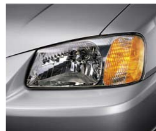
Front Clear Lens Head Lamps