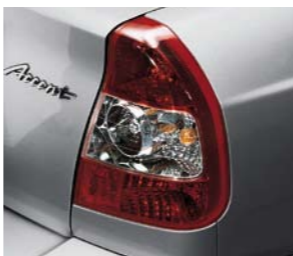
Clear Lens Type Rear Combination Lamps