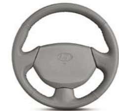
Leather Wrapped Steering Wheel