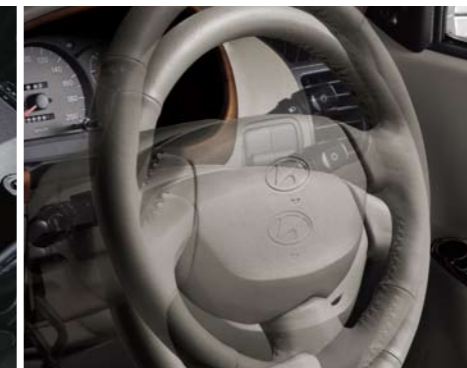
Power & Tilt Steering