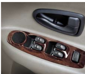
Central Door Locking