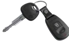
Keyless entry system