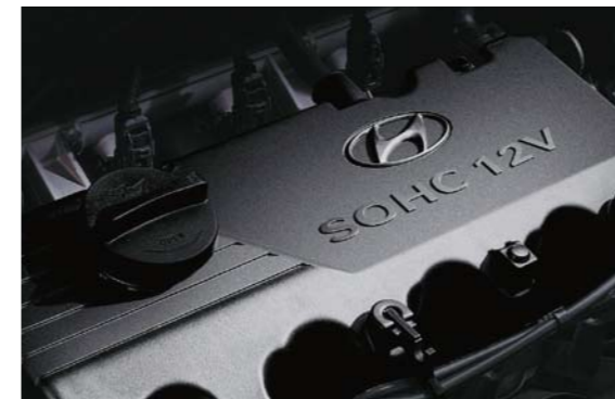
1.5 L SOHC Engine Max. Power (ps/rpm) 95/5500 Max. Torque (kgm/rpm) 12.7/3500