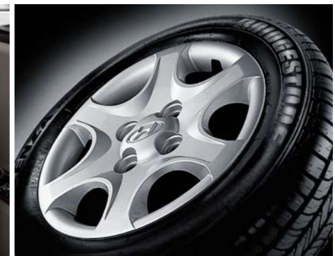
175/70 R13 tyres for better road grip with stylish wheel cover.